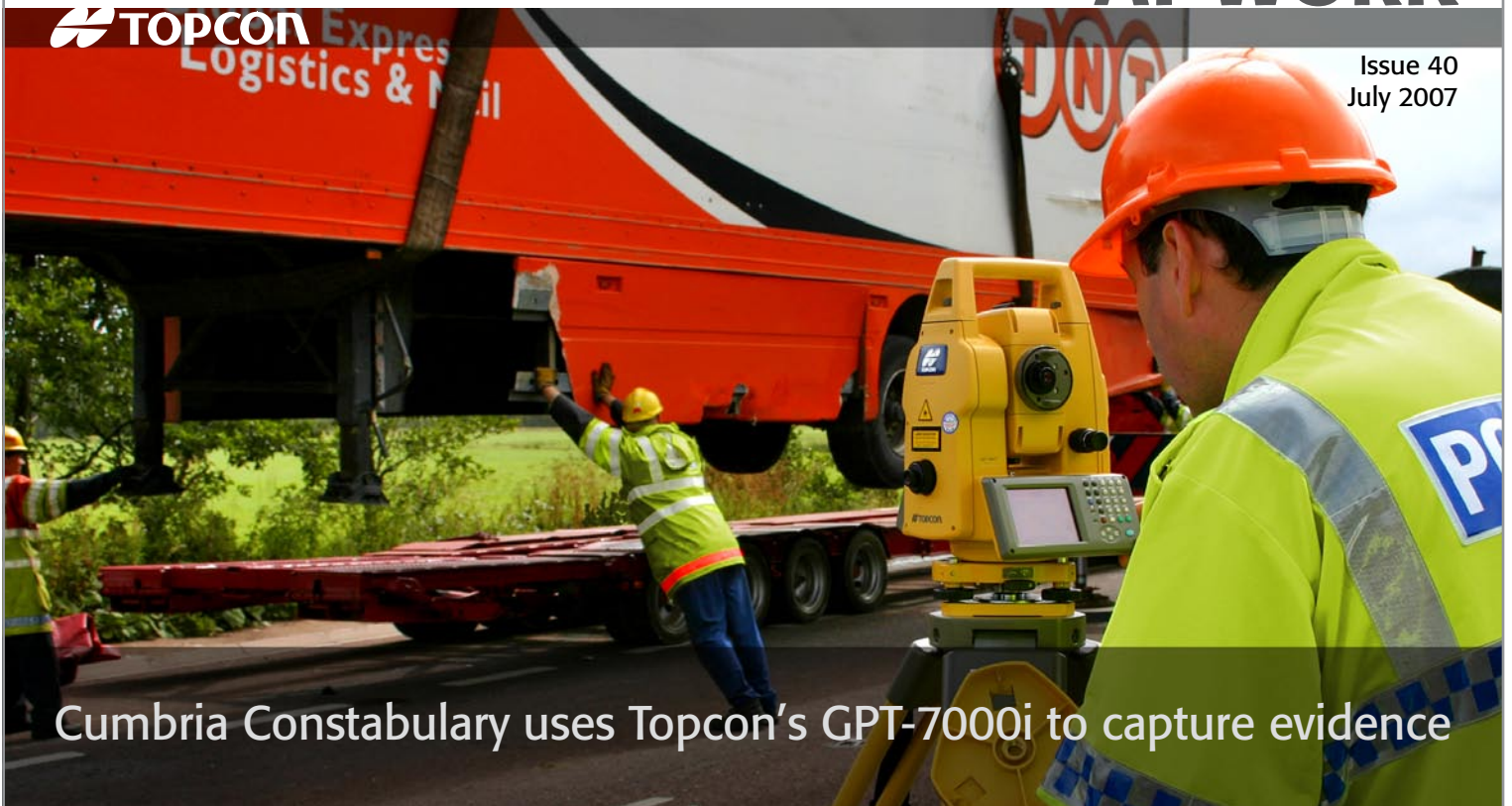
Cumbria Constabulary uses Topcon's GPT-7000i to capture evidence