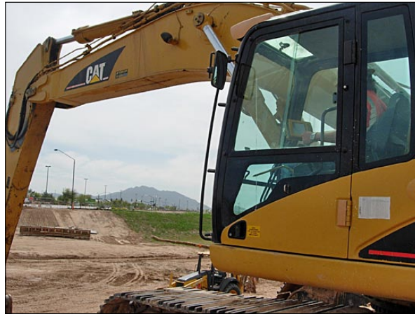
The bridge on Higley Road, a major north-south arterial east of Phoenix, crosses a wash in the Eastern Maricopa Floodway. A lane was to be added in each direction, necessitating the construction of five piers to support each new traffic lane.

Haydon's Caterpillar excavator was recently equipped with Topcon's X63 grade-control system, which is specifically designed for excavators. The system consists of four temperature-compensated 360-degree CAN-based tilt sensors that measure angles from the cab,