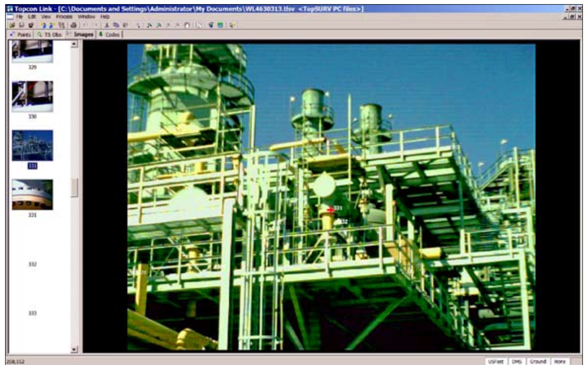
(Above) Wide-angle view shows general area of measurement point numbers (Below) Close-up view shows exact point of measurement - bottom of upper flange

More importantly, the GPT-7000i contains a digital camera that captures a wide-angle view of the general area and close-up views of each point measured. Detailed field notes are no longer required to validate point data. To provide the highest degree of accuracy