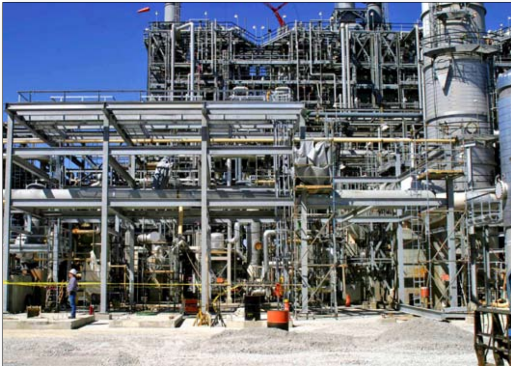
ENGlobals' typical job site - a maze of piping, tall structures, difficult access, and potentially hazardous conditions.

Process industries and energy producers are constantly modifying plant installations to improve efficiency or comply with environmental regulations. Industrial piping is designed schematically, built on site, and adjusted in the field to match existing conditions. There are no "as-built" surveys to reference when changes are proposed. Errors in measurement can mean time-consuming and costly rework when construction is underway. At the fast pace of production, these delays translate directly to lost profits and